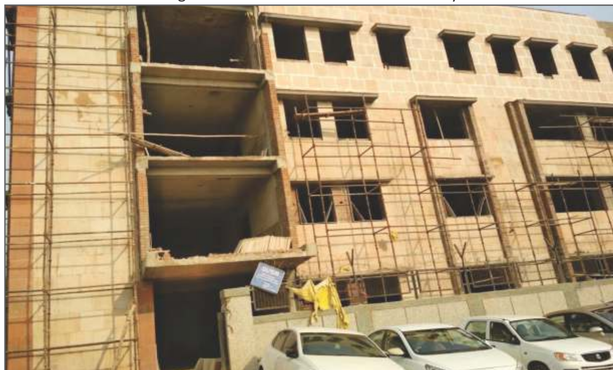
Night Shelter under Nulm at Geeta Colony

Construction of 02 shelter home at Sector 9 Dwarka & Geeta Colony is in progress and construction of remaining two shelters is to be reviewed. Apart from this, the refurbishment of 13 Night Shelters as per guidelines of NULM is in progress.