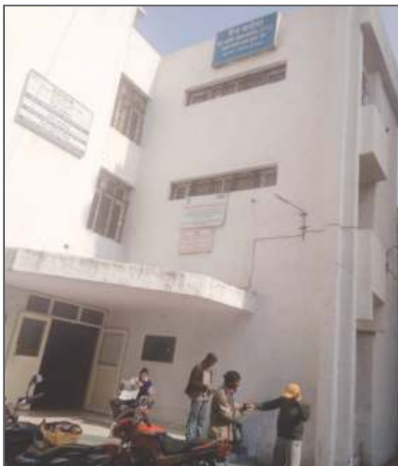
Permanent Night Shelter at Kotla Mubarakpur